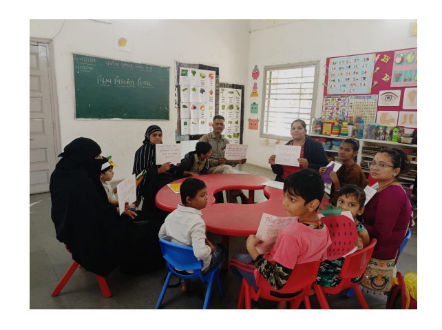
"Disability inclusion is not an act of charity but a fundamental human right." - International Disability Alliance.

Prabhat marked the International Day of Disability with a celebration that brought together children, parents, and students from Chirag School, Barrel Market, and Kankaria School No. 8. The event featured interactive sessions aimed at fostering inclusivity, building confidence, and creating opportunities for all. Sports activities and delightful meals added joy to the day across Prabhat's centers.