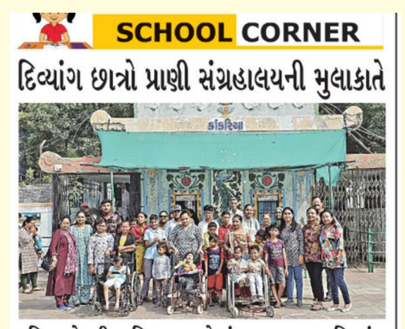
દક્ષિણ ઝોનની મ્યુનિ. શાળાઓમાં અભ્યાસ કરતા દિવ્યાંગ બાળકોએ કાંકરિયા તળાવ પરિસરમાં આવેલા પ્રાણી સંગ્રહાલયની મુલાકાત લીધી હતી.

Our children from the Kankaria School Resource Room enjoyed an outing to Kankaria Lake and Zoo. Joined by children from the other resource rooms of schools, they had the opportunity to explore the natural surroundings and make new friends. These exposure visits play a vital role in the overall development of children with special needs, fostering social skills, independence, and a sense of wonder.