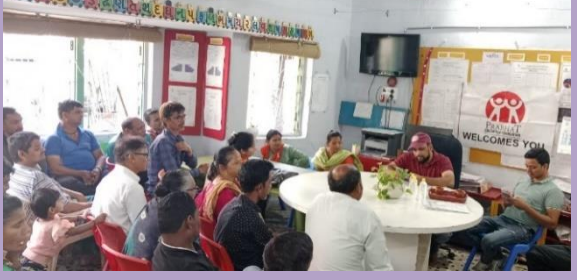
Aid Camp - Distribution of Tricycles