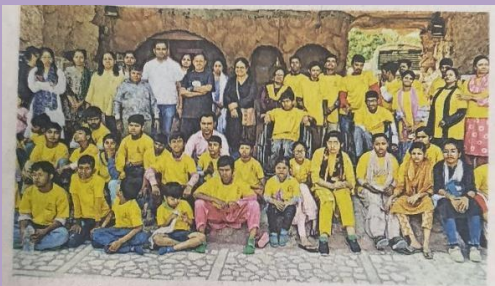
પ્રભાત ફાઉન્ડેશન દ્વારા વિશિષ્ટ જરૂરિયાત ધરાવતા બાળકોના સર્વાંગી વિકાસને ધ્યાને રાખી અને બહારના કુદરતી વાતાવરણમાં તેઓ મુક્ત રીતે રમી શકે અનુભવ કરી શકે, તે માટે ૪૧ બાળકોને મિની પાવાગઢ અને મિની અમરનાથનો પ્રવાસ કરવામાં આવ્યો હતો.