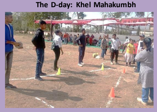
Learning art & Craft