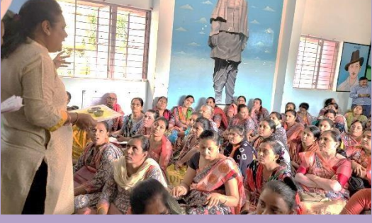
Account-opening processes by BOB