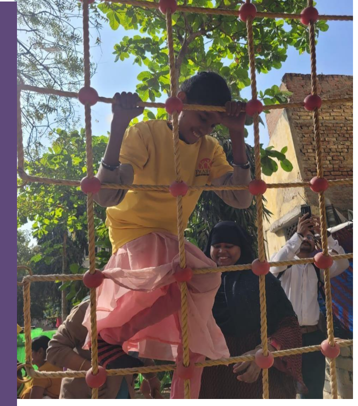
A still from 'Prem ground'