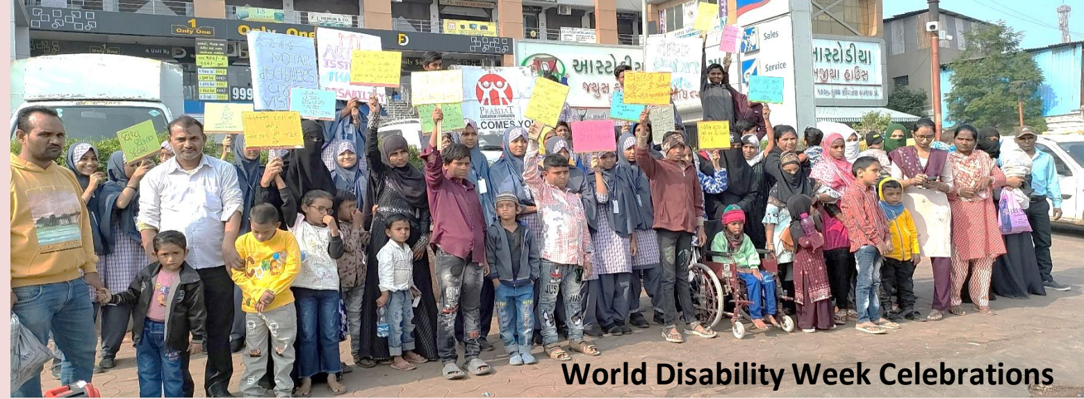
World Disability Week Celebrations

January 2023 | Issue No. 49 | A monthly newsletter