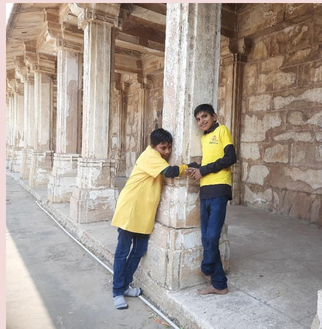
An opportunity to experience the historical heritage.

What started as a modest beginning with one child in 2007, has now reached to more than 3000 persons with disabilities in Ahmedabad as well as to their families, neighbours and communities.