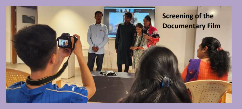
"Safe city" meeting