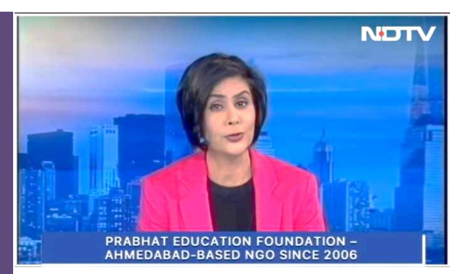
Prabhat dawns at a national level!

What started as a modest beginning, with one child in 2007, has now reached to more than 3000 persons with disabilities in Ahmedabad as well as to their families, neighbours and communities.