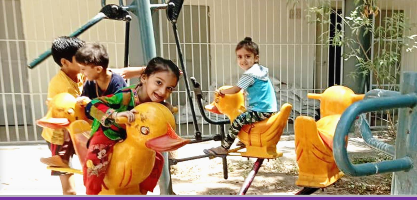
May 2023 | Issue No. 42 | A monthly newsletter