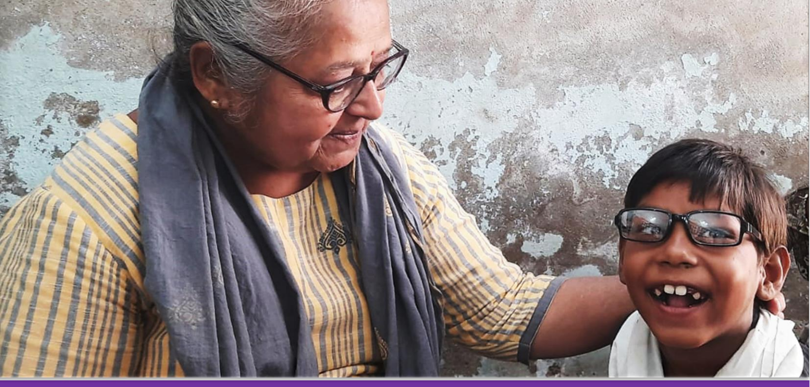
April 2023 | Issue No. 41 | A monthly newsletter