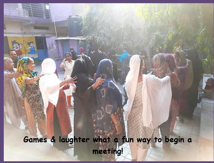
Games & laughter what a fun way to begin a meeting!