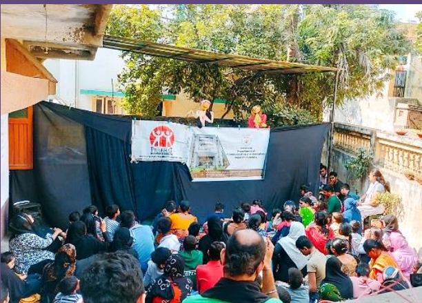
Puppet show by Dev Comm. Students of Guj. Univ