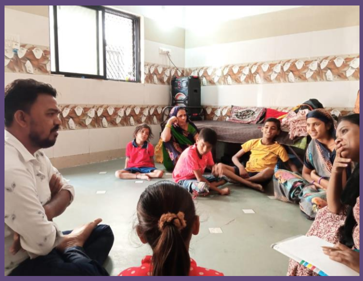
Research for impact analysis underway