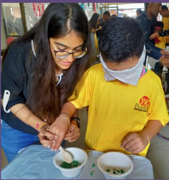
Fun event by GLS