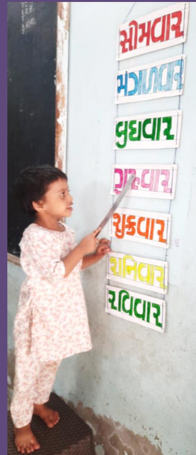
Teaching is a way of learning!