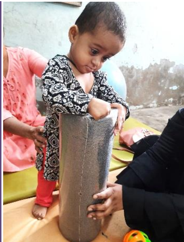
Checking out the therapy equipment!

What started as a modest beginning, with one child in 2007, has now reached to more than 3000 persons with disabilities in Ahmedabad as well as to their families, neighbours and communities.