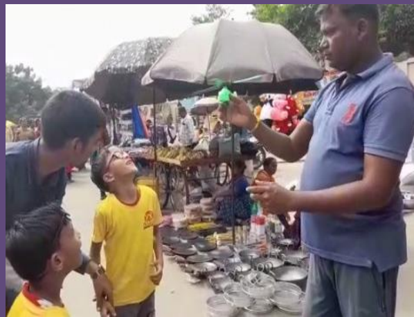
The colourful joy at the fun fair!