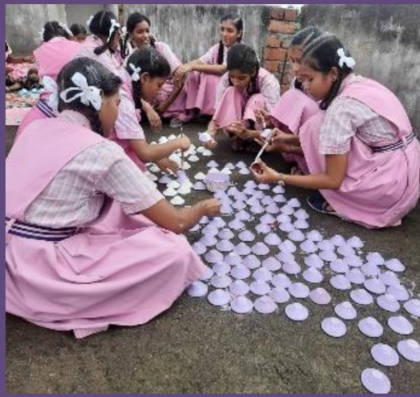
Diya prep! We all get involved