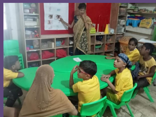
The little teacher in action!