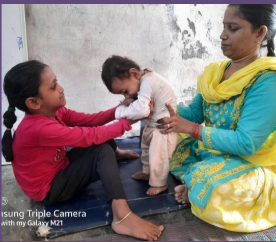
Providing assistance like a pro!