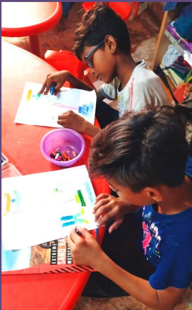
Flag drawing in the making!