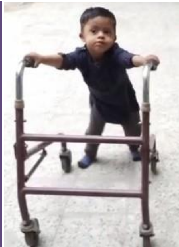
Standing and walking, some of the joys we take for granted!

What started as a modest beginning, with one child in 2007, has now reached to more than 3000 persons with disabilities in Ahmedabad as well as to their families, neighbours and communities.