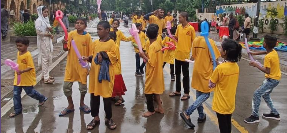
Rain...sun...shine...nothing deters us from having fun!