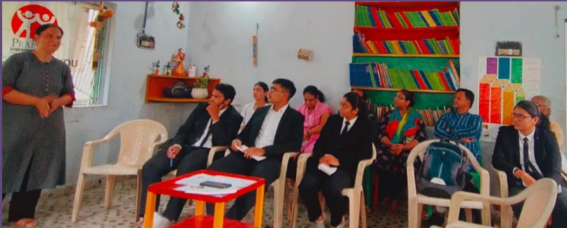
Understanding more about inclusive education!