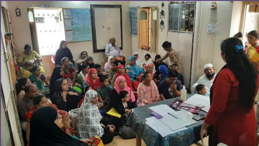
Parent meeting at Danilimda Centre