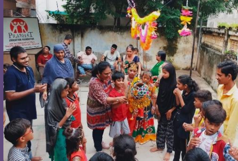
Joy & fun in celebrations!