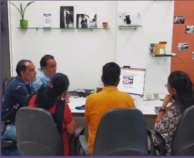
Meetings are essential for better implementation of initiatives