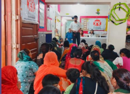
Understanding the magic hidden in your kitchen!