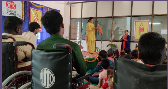
Community engagement through 'Arts'

Prabhat Education Foundation A-4, Sujal apartment Opp. Satellite bungalow Ramdevnagar Ahmedabad 380015