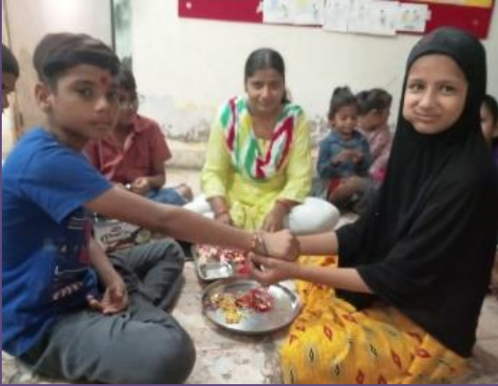
Building greater bonds!