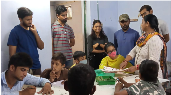
Visit by NID Students