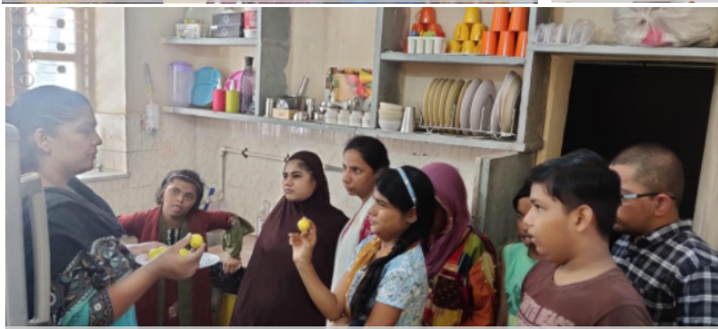
Learning to make Lemonade