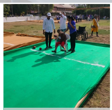
Mahakumbh Mela Participation