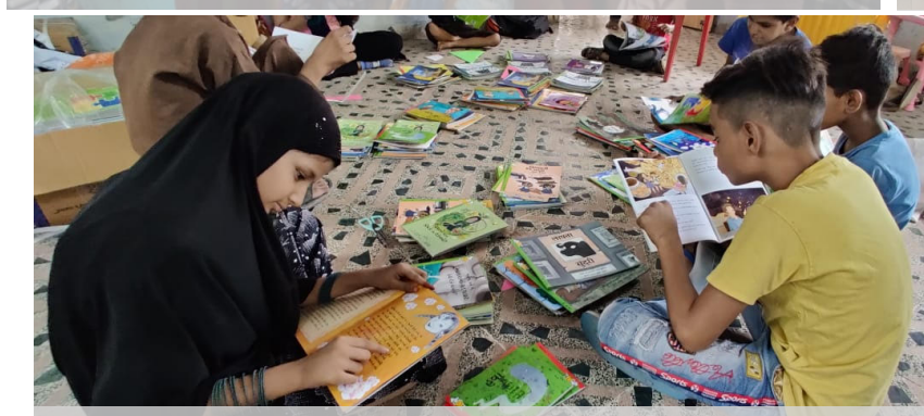
Reading Time in the Library