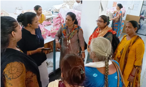
Norquest Brand Pvt Ltd Team Visit to Prabhat