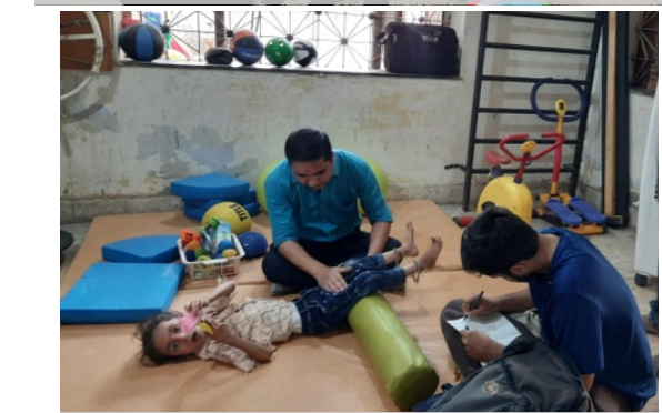
Physiotherapy Session in Progress