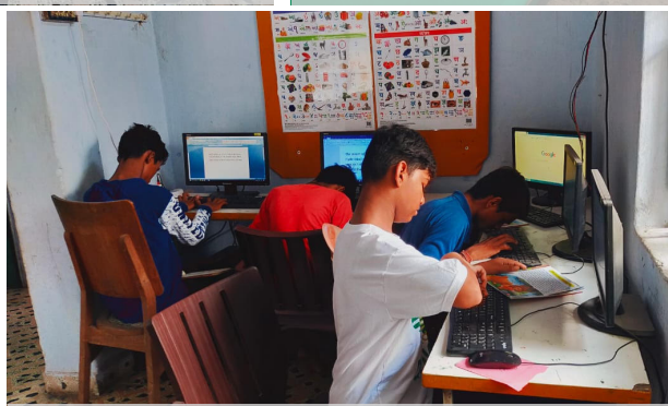
Training for Vocational Skills

Prabhat Education Foundation A-4, Sujal Apartments, Opp. Satellite Bungalows, Ramdevnagar, Ahmedabad 380015 Ph: +91 79-4890-305 | Email: prabhat@prabhatedu.org Website: prabhateducationfoundation.org