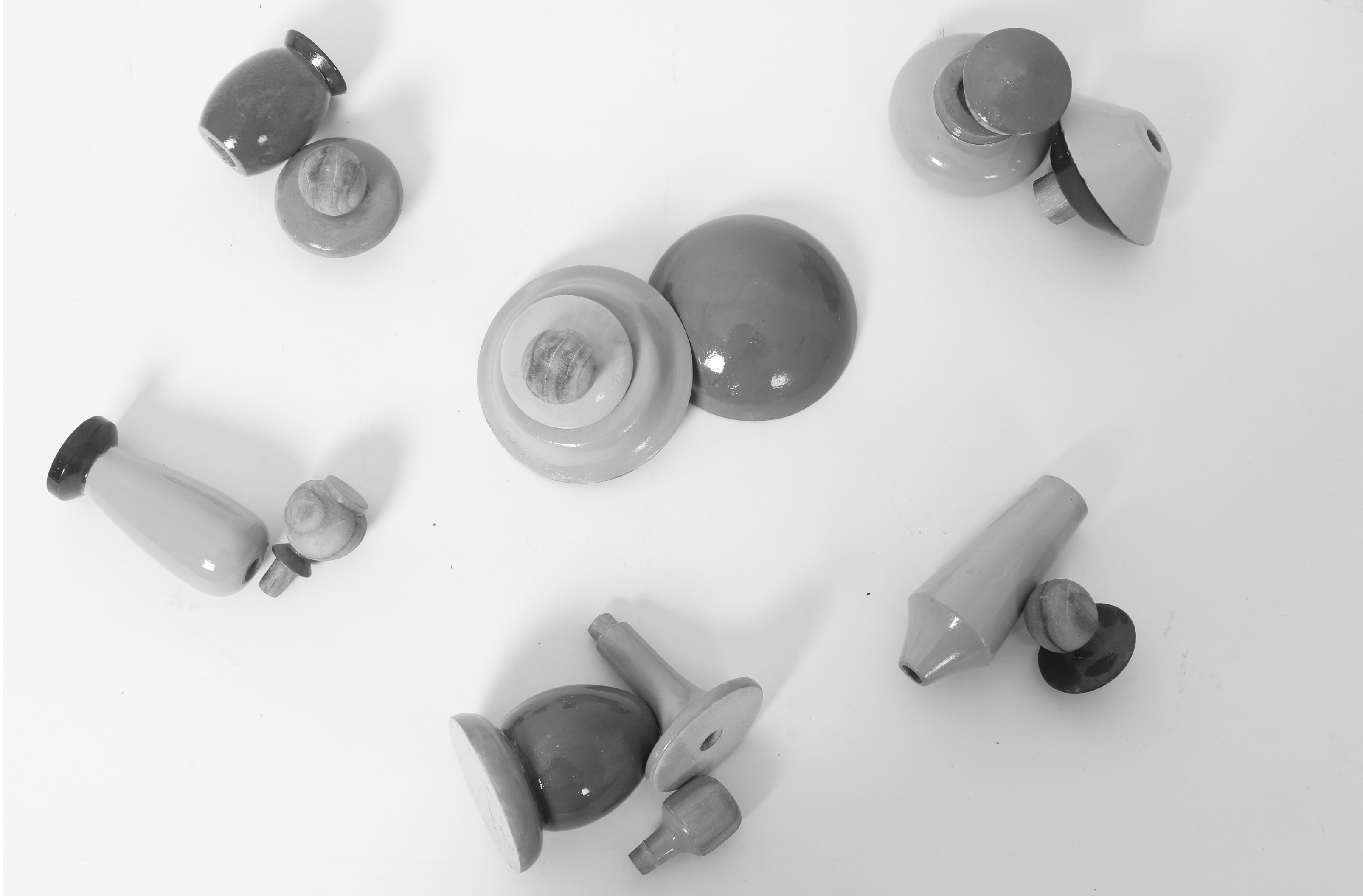
The Abled Souvenir